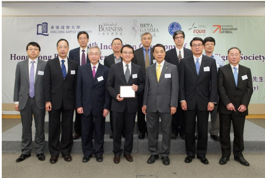
Photo from 4 th Induction Ceremony